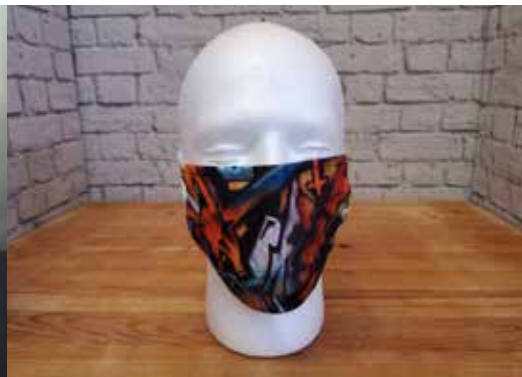
CUSTOM SUBLIMATED MASQ