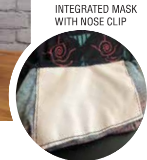
INTEGRATED MASK WITH NOSE CLIP