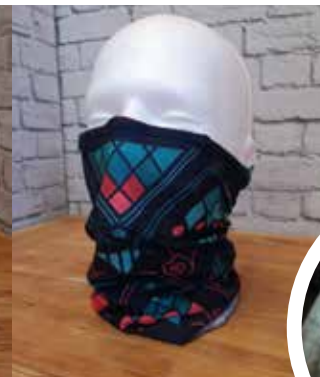
CUSTOM SUBLIMATED NECK WARMER